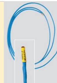
10mm OD RTD 5KV PTSE

Notes: All products are shipped FOB Yulee, FL, plus freight cost.